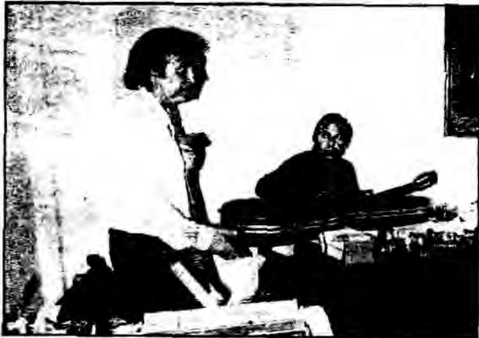
JUAN PEÑA "EL LEBRIJANO" AND PACO CEPERO

"I have just finished a record with Rocio Jurado and most of this summer, at least July and August, I shall be working with the Mexican singer José José. Regrettably, I shall miss going to the flamenco festivals. Madrid is Madrid, but I still enjoy shooting down to my land once in a while."