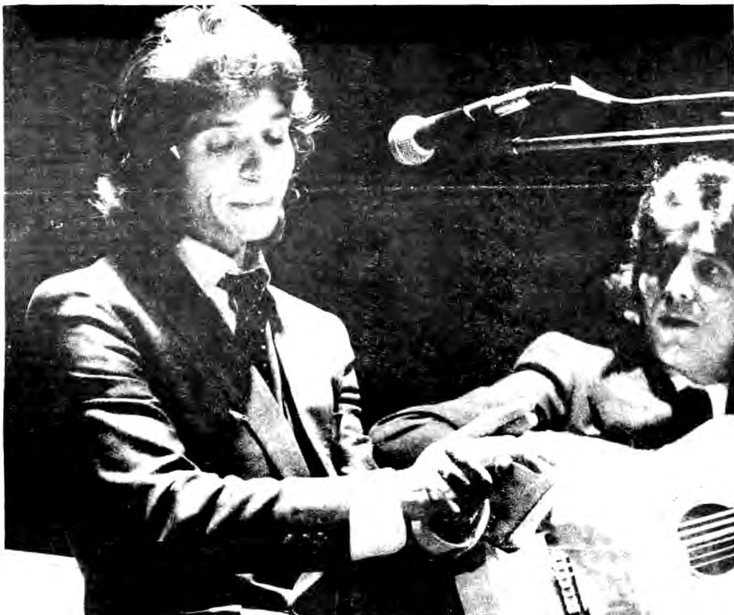
CAMARÓN DE LA ISLA WITH TOMATITO

His cosmic wisdom and his mathematical rhythm come from far away. To dig any deeper into him would be to mistreat him.