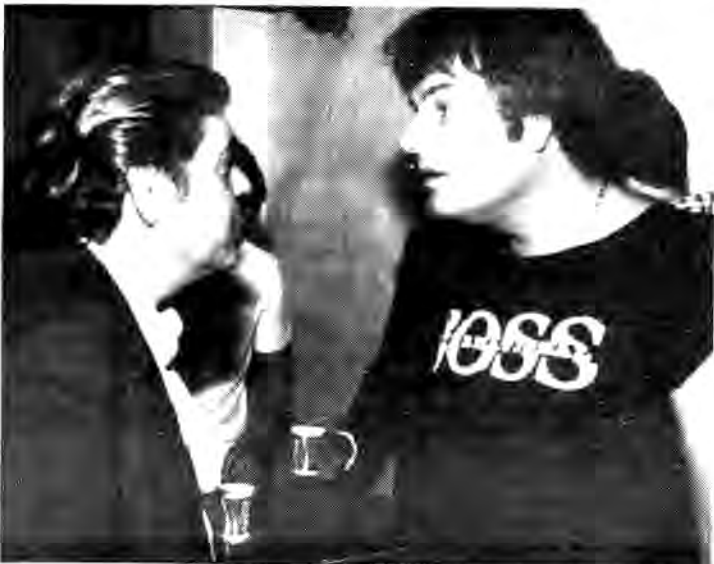
EL SORDERA WITH EL CARBONERO