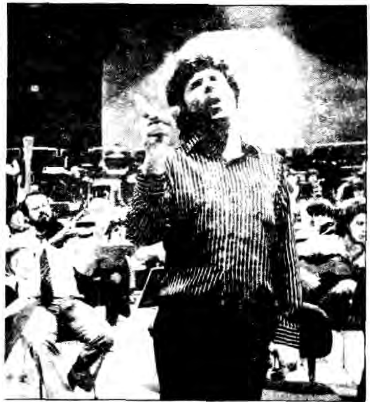
ENRIQUE MORENTE IN REHEARSAL

Certainly the artistic credo of Enrique Morente can be summed up in few words: "Purity must be preserved, but sometimes things must be stirred up in order not to stagnate and also in order to know what not to do in case things don't turn out right." New and unpublished things can be injected into flamenco without betraying the essence of true flamenco. If it is done with art, and talent, with sincerity and without vanity, Morente believes that the innovations are positive and true.