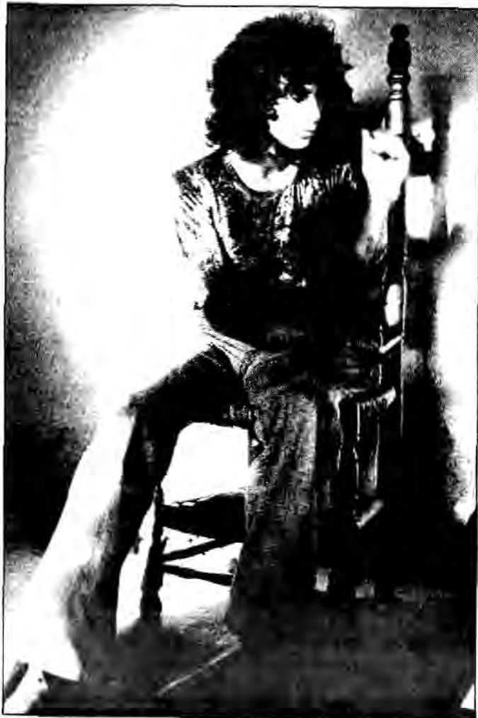
GUITARIST OF PATA NEGRA, RAIMUNDO AMADOR