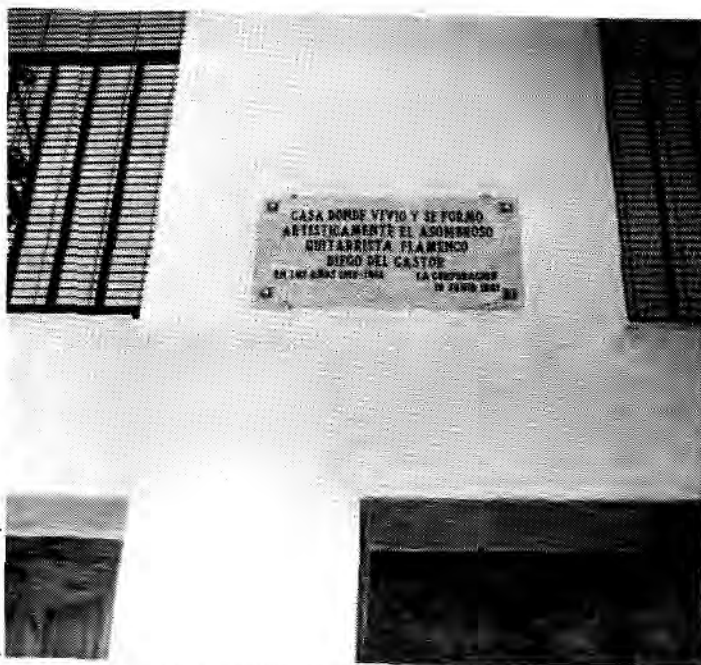
WALL PLAQUE COMMEMORATING DIEGO DEL GASTOR