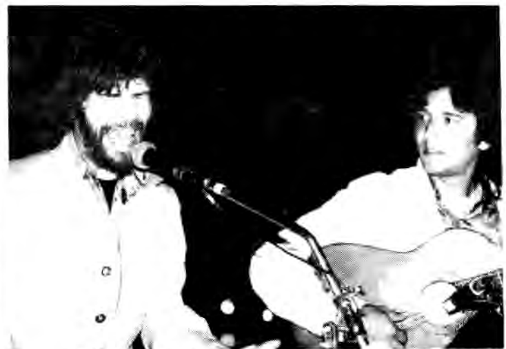
EL CAMARÓN WITH TOMATITO; CHICLANA, JUNE 1986