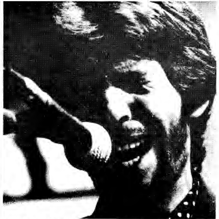
CAMARÓN DURING HIS PERFORMANCE IN THE FIESTAS OF SAN ISIDRO

"I didn't know him very well, but almost every day I went there to party, mainly to irritate him, because he would sit there and wait for me to ask him to sing, but I wouldn't ask him, and finally, he couldn't take it anymore and he would get up and dance and sing the way he used to. And then he would