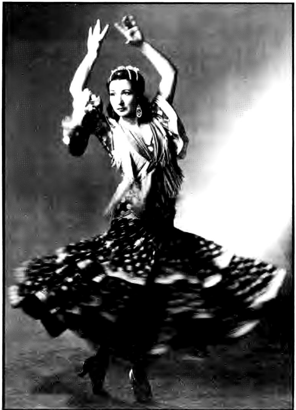
La Meri - Zambra

La Meri was a close friend of Argentinita and her sister, Pilar Lopez, and it was at Argentinita's behest that she began teaching in 1942 at Jacob's Pillow, where she remained as a resident teacher, performer, and choreog-