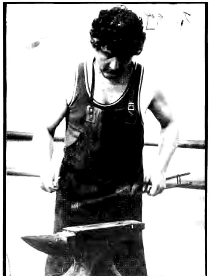
El Niño in Martinete