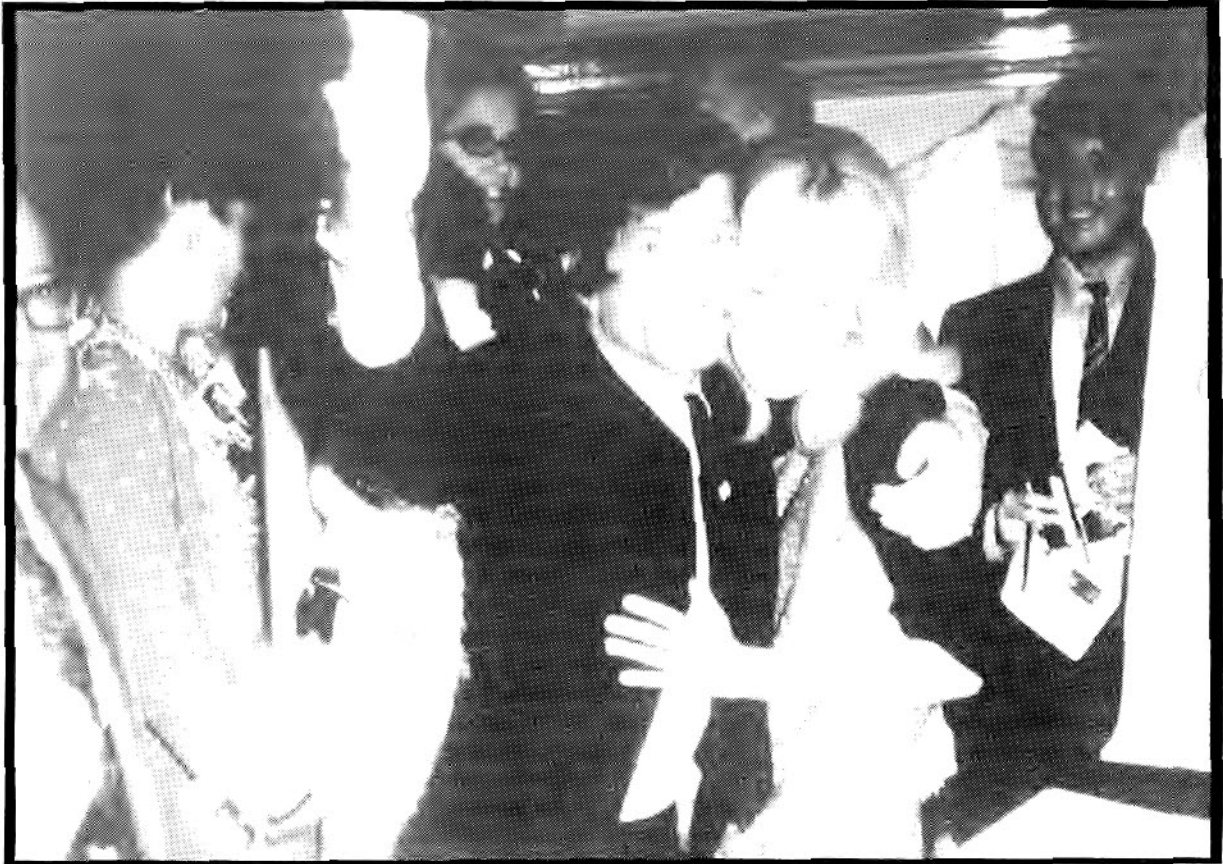
Above: Manitas de Plata. (The blond was a total stranger.)