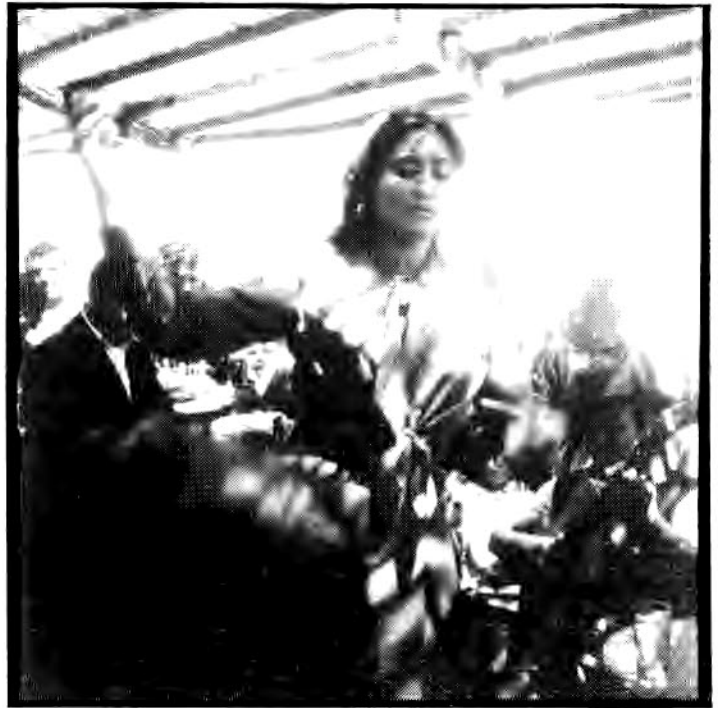
Gypsy girl dancing.

Sears. It featured music by the famous Amaya clan. An amateur guitar builder, I also loved Latin music and participated in parties at which Cuban and Mexican music was played and sung. I was a subscriber to the British magazine, Guitar News , and in the no. 76 issue, there was a description of